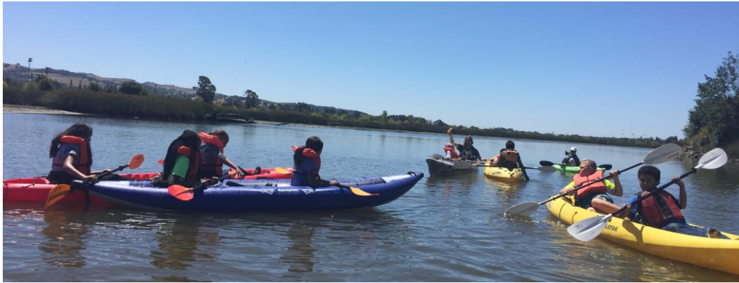
Boys & Girls Club students learn about the Napa River as they ride the tides, summer 2016.