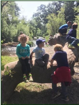
Field trips to the river and watershed spark curiosity.